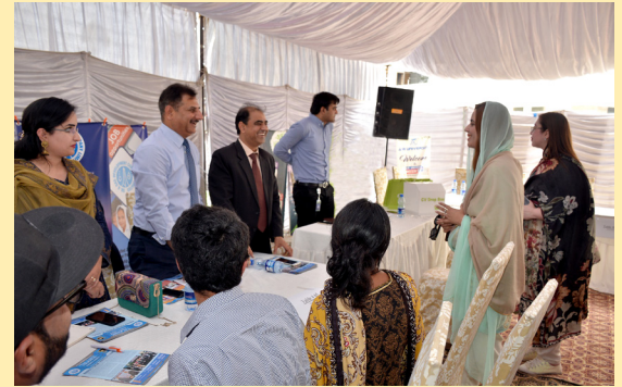
OGDCL stall at Career Fair