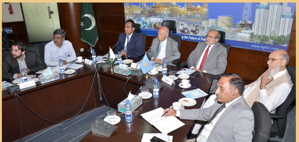
Meeting in full swing

The meeting was attended by 32 representatives of 12 E&P Companies which included Hycarbex, MOL, MPCL, OPL, PEL, POL, PPL, SEPL, PGNIG, ENI, AL-HAJ and OGDCL. The purpose of the meeting was to discuss details of exploration activities being carried out by the Companies working in E&P sector. The meeting concluded with a note of thanks to the participants for their participation and was followed by a sumptuous lunch.