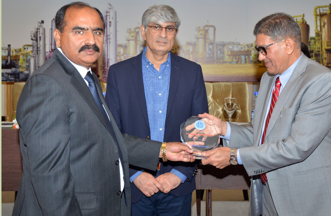
President Officers Association, OGDCL, presenting shield to Chairman OGDCL Board

Stinguished Guests & Officers ER" from OGDCL Officers Association