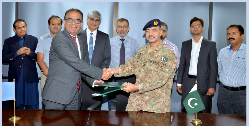
MOU signing ceremony held

The MOU would strengthen relationship between both the entities in the fields of R&D, training and Corporate Social Responsibility (CSR). Under the arrangement, the ICE2 would extend support to OGDCL in technical issues, guidance in locally made equipment and provision of trainings. While, OGDCL, through its CSR programmes would extend support in R&D and training besides encouraging in start-up programmes.