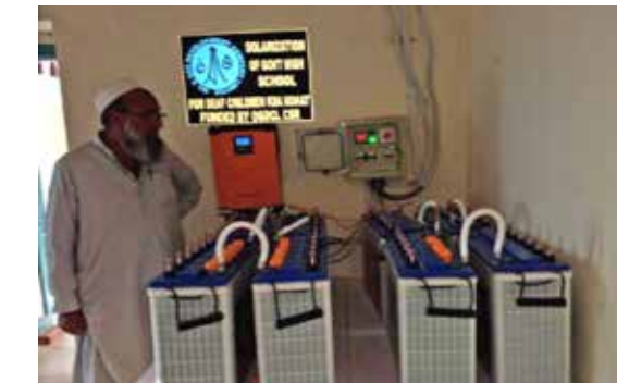
SOLARIZATION OF GOVERNMENT HIGH SCHOOL FOR DEAF CHILDREN, DISTRICT KOHAT