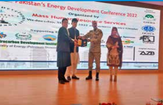
OGDCL Sponsors Pakistan's Energy Development Conference 2022