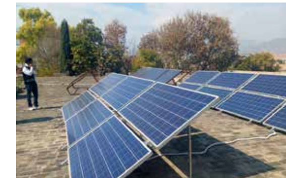
INSTALLATION OF 5KW SOLAR SYSTEM IN GOVERNMENT COLLAGE OF TECHNOLOGY KOHAT