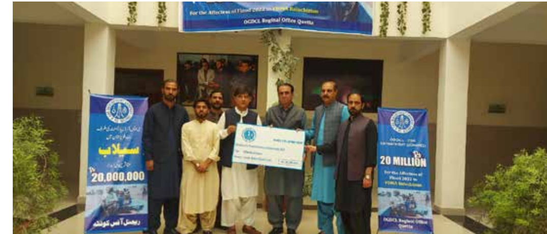
Donated Rs 20 million to Provincial Disaster Management Authority, Balochistan