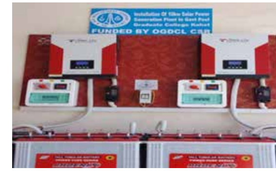
INSTALLATION OF 10KW SOLAR SYSTEM IN GOVERNMENT POST GRADUATE COLLAGE KOHAT