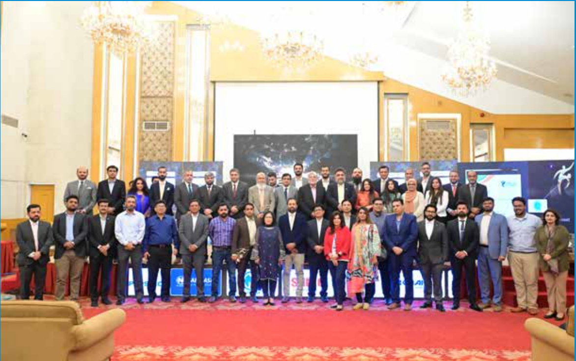
11th CSR summit and awards held on March 2nd ,2022 organized by The Professional Network (TPN)