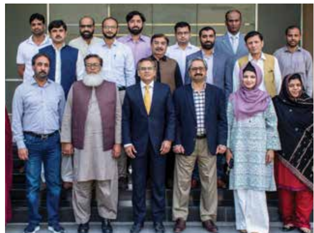
Participants of Train the HSE Trainer