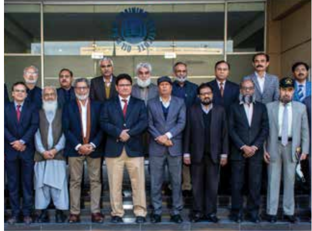
Participants of Enterprise Risk & Crisis Management