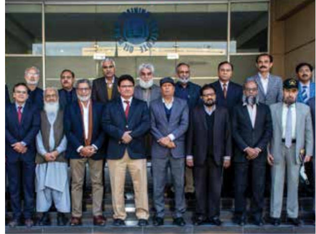
Participants of Enterprise Risk & Crisis Management