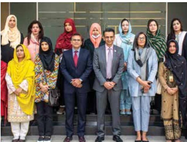
Participants of Women's Strategic Leadership