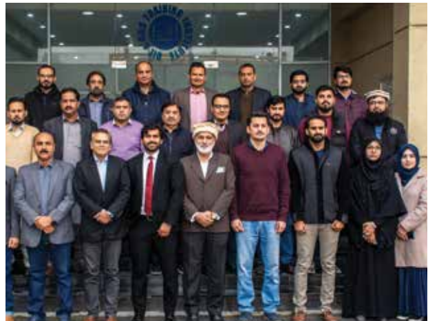
Participants of Process Safety Management