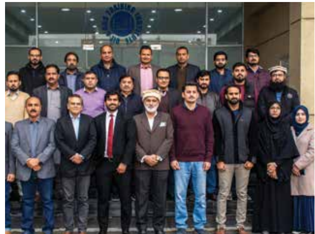
Participants of Process Safety Management