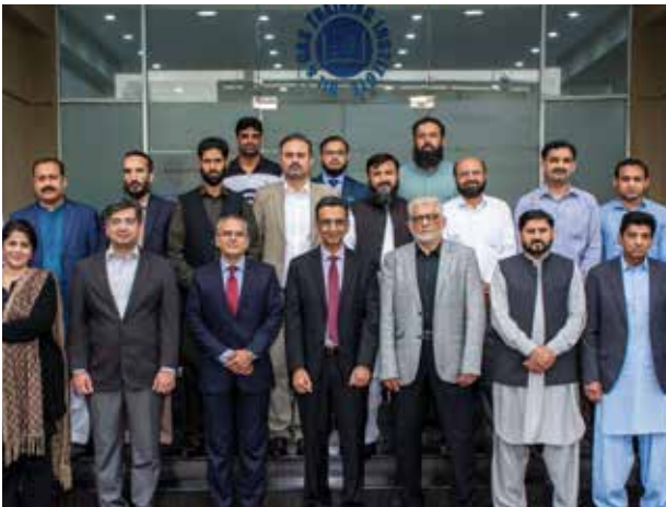
Participants of Presentation & Communication Skills