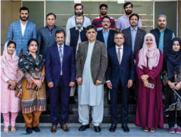
Participants of Efficiency & Discipline Rules