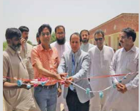
Inauguration of OGDCL block in Govt Girls High School, Chakwal