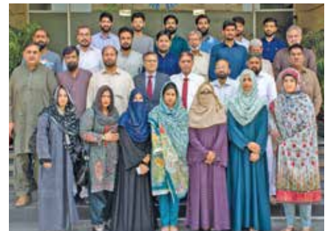
Participants of Advance Excel Training