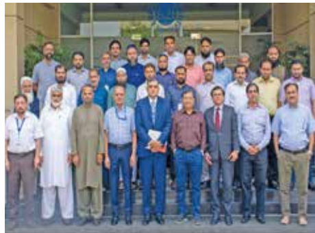
Participants of HSE Leadership Workshop-II