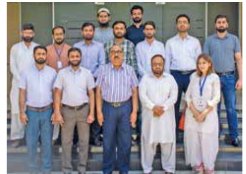
Participants of Tight Gas Characterization Training