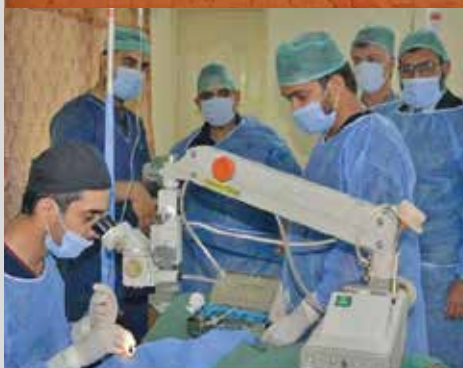
Three days free Surgical Eye Camp at Chaknaurang oil field