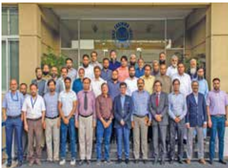
Participants of HSE Leadership Workshop