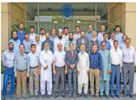
Participants of HSE Leadership Workshop-I