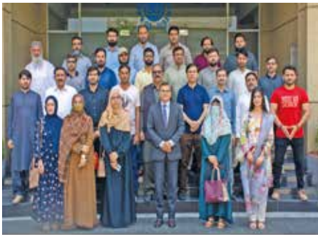
Participants of Integrated Waste Management Protocols in Oil and Gas Industry Workshop