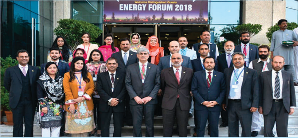
Group photo of participants

Page 02 Annual Technical Conference 2018