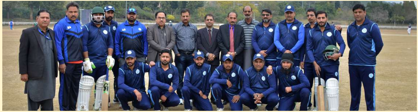
OGDCL officials with the victorious team of OGDCL