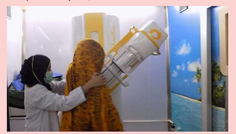
Doctor examining the patient